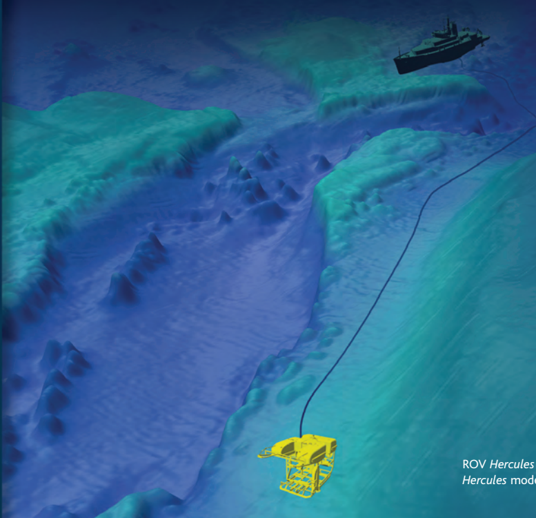
ROV Hercules exploring the West Flower Garden Bank, Gulf of Mexico, from mapping by USGS. Hercules model courtesy of the Institute for Exploration.

FM Viz4D moves users beyond static 2D representation and analysis to an intuitive and dynamic 4D environment. It combines quantitative tools with easy import of multiple types of data, giving you the ability to build integrated scenes, create high resolution images and movies, and export to standard GIS and CAD packages. FM Viz4D is truly more than " just a pretty picture " – it's a comprehensive visualization and interpretation environment.